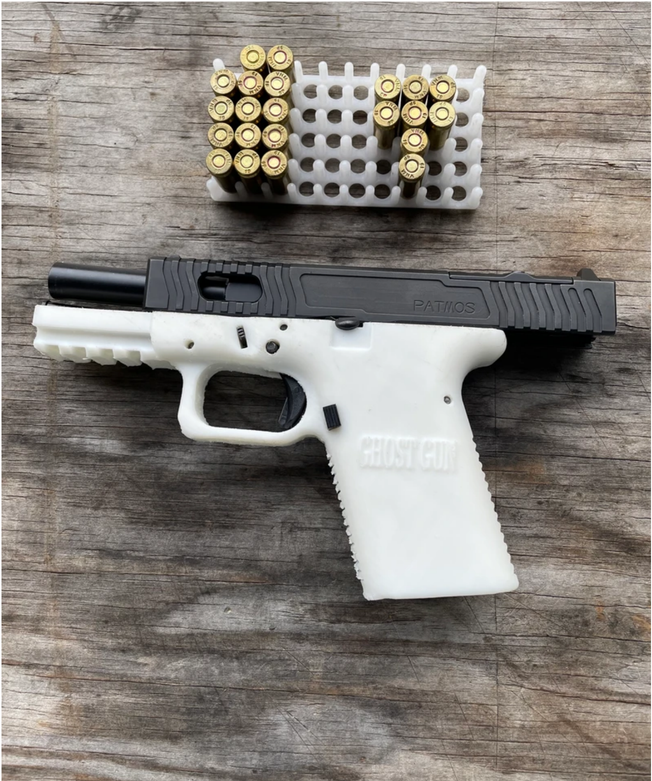
THE AUTHOR'S 3D-PRINTED GLOCK 19 9MM PISTOL WITH THE WORDS "GHOST GUN" ON THE GRIP.

“You need the metal parts,” Pincus told me. “Technically, could you build one out of all plastic? Yes. Is it going to be reliable and awesome? Probably not.”