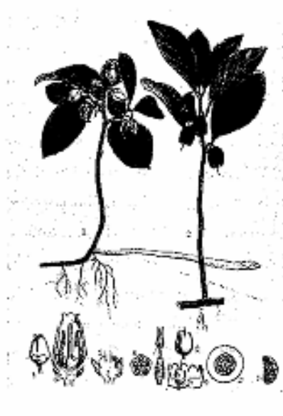
Wintergreen ( Gaultheria procumbens )

Wintergreen is a member of the heath family but does not seem to possess the same psychotropic properties that many of the heath family members possess. (Even so, it has been used as an anodyne, for neuralgia, and as a stimulant—all general actions of narcotics.) While the plant itself is benign in large doses, the oil should be used with caution. 31