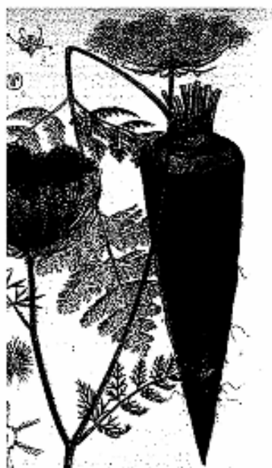
Wild carrot seed (Daucus carota)

Much of the research on carrot has been concerned with the domestic root. It is high in nutritive compounds that have been found to play a significant role in health. Less research has been conducted on the wild carrot, Queen Anne's lace, or the seeds of either domestic or wild carrot. However, the seeds contain many of the same compounds as the root, and more research should be conducted. In general, the seed of wild carrot is considered effective for promoting delayed menstruation, for treatment of urinary tract infections and kidney stones, and for flatulence and intestinal cramping.