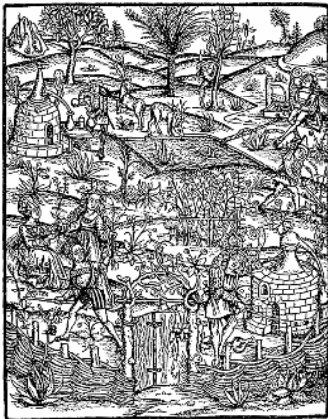
A Mediaeval Garden of Herbs from Brunschwig's Liber de Arte Distillandi , Strassburg, Grüniger, 1500

ancient tradition, was not “corn”—that is, maize—but grain. Their Old World word—corn—was attached to the grain that came from the New World—maize—which is now the only grain known as corn. So any stories about “corn” actually mean grain.