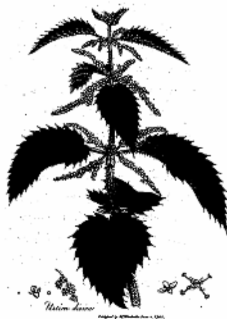
Nettle ( Urtica dioica )

Nettle also produces a very fine cloth when woven, a durable paper, a colorful green dye, powerful fertilizer, and an extremely nutritious fodder