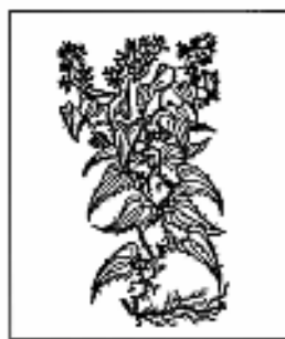
Wild Sarsaparilla ( Aralia nudicaulis )

Wild Sarsaparilla is considered to be a reliable substitute for any of the Smilax species. The root is alterative, was used in pulmonary complaints, as a general tonic, for lassitude, general debility, stomachaches, and as a wash for shingles and indolent ulcers of the skin in primary nineteenth-century herbal practice. In folk practice it was used as a diuretic and blood purifier, for stomachaches, fevers, coughs, and to promote sweating. American Indians used it in virtually the same ways for hundreds of years. 51