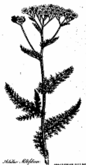
Yarrow ( Achillea millefolium )

or crushed fresh plant, when placed in such wounds immediately staunches bleeding and causes the wound walls to begin drawing together and knitting. Additionally, its analgesic action helps reduce the pain of the wound, and its antibacterial, antimicrobial, and antiseptic actions help prevent infection.