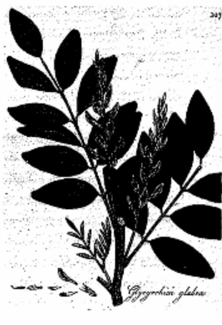
Licorice ( Glycyrrhiza glabra )

Licorice also finds strong application in treatment of ulceration in the stomach. The dried herb, powdered, should be used. If the ulceration is present in the stomach, one ounce of the powdered herb should be