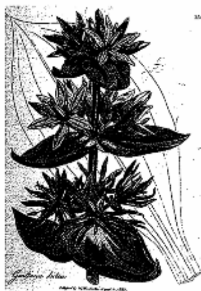
Gentian ( Gentiana lutea )

203 Gentian is primarily a digestive bitter and stimulates gastric secretions and function. It is one of the oldest digestive tonic herbs. Its American relative, Sisertia radiata —green gentian or cebadilla, is used similarly, being somewhat stronger and more energetic in its actions. The root of the plant is used and is indicated in all conditions of feeble digestion. Additionally, it is a mild stimulant to the circulation and warming to the body. I have rarely worked with the English plant and have come to use somewhat regularly the American version. I have found it easily throughout the Rocky Mountains. It is a biennial plant, the