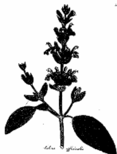
Sage ( Salvia spp.)

horto?—"Why should a man die whilst sage grows in his garden?" Sage has long had a reputation as an herb that mitigates mental and bodily grief, heals the nerves, counteracts fear, and protects human beings from evil influences, spiritual and physical.