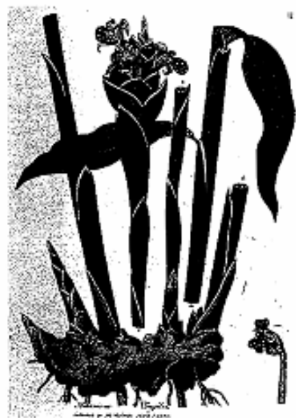
Ginger ( Zingiber officinale )