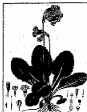
Cowslip ( Primula veris )

Cowslip sends up a flowering stalk between March and May, and this is generally what is harvested for use in herbal medicine and in beers and