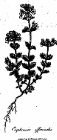
Eyebright ( Euphrasia officinalis )

Mash the barley in water at 150 degrees F for 90 minutes. Sparge with boiling water until a total of 4 gallons is drawn off. Boil the 4 gallons water with the herb for one hour. Strain, add 2 pounds sugar and stir until dissolved. Cool to 70 degrees F and pour into fermenter; add yeast. Ferment until complete, approximately one week, siphon into bottles primed with 1/2 teaspoon sugar, and cap. Ready to drink in 10 days to two weeks.