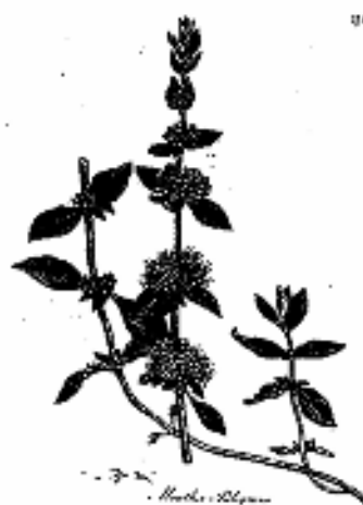
Pennyroyal ( Mentha pulegium )

Pennyroyal has an extremely long history of use in herbal medicine. The European pennyroyal, Mentha pulegium , and its American cousin, Hedeoma pulegioides , possess similar properties and action. It is an annual herb with a branching square stem somewhat like mint, 6 to 12 inches high, with a profusion of small, light blue flowers. The above-ground herb is used in brewing and herbalism. It is best known for its action in starting delayed menstruation, and has been traditionally used as an abortifacient in large doses. The oil that is sometimes used for this is very strong, and toxic reactions are common from its use. Its use is not suggested. The herb also possesses strong relaxant properties and has been traditionally used in the treatment of anxiety. Part of this action is attributable to the wonderfully aromatic volatile oil pennyroyal possesses. It reduces flatulence and intestinal cramping and relaxes smooth muscle