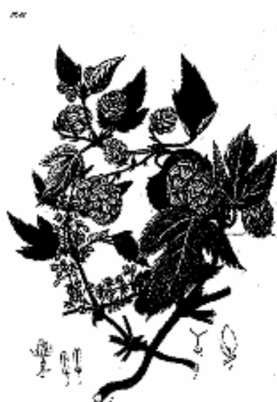
Hops (Humulus lupulus)

for home use. Hops are used in standard practice herbal medicine in three ways: as a soporific (sleep inducer), as a diuretic (promoting urine