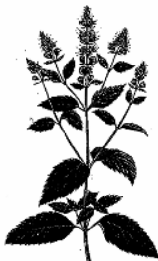
Peppermint ( Mentha piperita )

abundance, is strongly antispasmodic. Medical researchers, trying to find something to quiet the cramping when inserting small optical cameras into the intestine, tried a variety of drugs, all of which proved ineffective or too toxic. A small amount of peppermint oil, coating their instruments, effectively stopped intestinal spasming. (They found the information in an old herbal text.) Pain from duodenal or stomach ulceration is helped almost immediately by peppermint, as is irritable bowel syndrome, stomach cramping, and any kind of nausea, including motion and morning sickness. The pain of gall and kidney stones is often helped by the use of peppermint. In duodenal ulceration and irritable bowel syndrome, peppermint is more effective if a small amount of the oil is mixed with marshmallow or slippery elm root and taken in capsule. This mucilaginous mass sits in the bottom of the stomach, then drops down into the duodenum fairly intact and immediately soothes the affected area. As peppermint is safe for use in pregnancy, it is of tremendous benefit for attendant nausea.