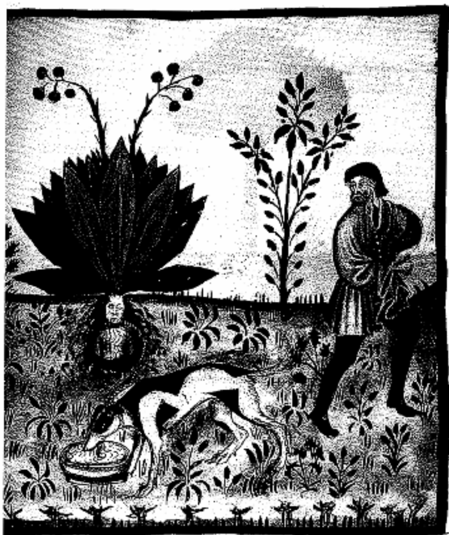
A dog is used to pull the still sleeping mandrake from the earth. (Illustration from Tacuinum sanitatis, in Medicina sanitatis, Codex Vindobonensis.)