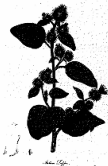
Burdock ( Arctium lappa )

The similarity of effect of nettles, burdock, sarsaparilla, and dandelion (as you will see) make them an ideal combination for a spring tonic beer or herbal preparation. The beer would help cleanse toxins from the blood, reduce or alleviate rheumatic problems, help clear up skin conditions, increase strength of the immune system, normalize digestion, restore liver and gallbladder function, and normalize pancreatic function. It is no wonder then that burdock, as well as these other herbs, is often added to nettle beer.