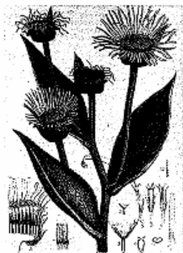
Elecampane (Inula helenium)

Boil sugar, malt extract, herb, and water for 30 minutes. Cool to 70 degrees F, strain into fermenter, and add yeast. Ferment until complete, approximately one week, siphon into bottles primed with 1/2 teaspoon sugar, and cap. Ready to drink in 10 days to two weeks.