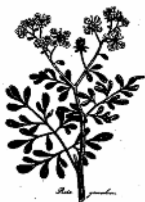
Common rue ( Ruta graveolens )

For feebleness of sight put rue in a pot with ale and let the patient to drink of it.