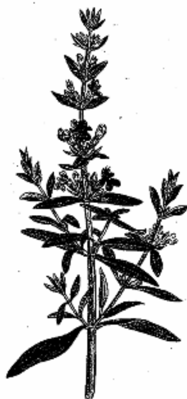
Hyssopus officinalis Linnaeus, Medicinal Herbs, 1750