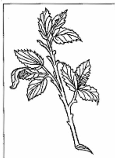
Birch ( Betula fontinalis )

First make an incision & an hole through ye bark of one of ye largest birch tree bows, & put a quill therein, & quickly you shall perceive ye juice to distill. You may make incision into severall bowes at once, which water ye receive into whatever vessill you pleas. It will continew running 9 or 10 days, & if yr tree be large, it will afford you gallons. Boyle it will, as you doe beer, but first put to every gallon, one pound of white powdered sugar. When it is well boyled, take it of the fire, & put in