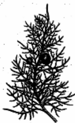
Juniper ( Juniperus spp.)