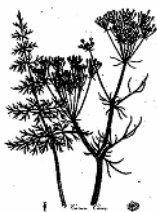
Caraway ( Carum carvi )

To make a caraway ale, it is better to use a heavy malt and end up with a flavor somewhat like bread in which caraway seeds have been cooked. As you can imagine, it can be quite tasty when properly prepared.