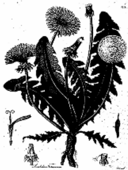
Dandelion ( Taraxacum officinale )

Dandelion is a bitter (like hops) and stimulates digestion. While the leaf is one of the best diuretics available, it also contains large amounts of potassium (which the root does not). Excessive urination depletes the body of potassium, which is why many physicians prescribe potassium supplements with any diuretics they dispense. Dandelion leaf replaces all the potassium that is lost through its diuretic action. 39