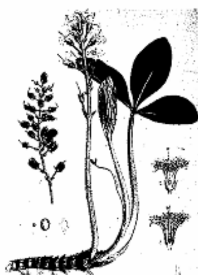
Buckbean ( Menyanthes trifoliata )

Bogbean is a bitter, like so many other herbs used in ale, and thus stimulates stomach secretions, making it helpful in feeble gastric conditions. It is also a diuretic, stimulating urine flow, a cholagogue (producing gallbladder contraction), and an antirheumatic. It is a perennial plant, growing about a foot high and possessing leaf stalks with three leaves at the terminal end ( trifoliata ). Both the leaves and root can be used medicinally, though the leaves are generally more common in practice. Bogbean is indigenous to both the United States and Europe and likes