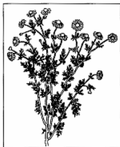
Chamomile ( Matricaria chamomilla )

Boil chamomile and water for one hour, cool, strain, and pour over sugar. Stir until sugar is dissolved, cool to 70 degrees F, pour into fermenter, and add yeast. Ferment until complete. Prime bottles, siphon, and cap. Ready in one week.