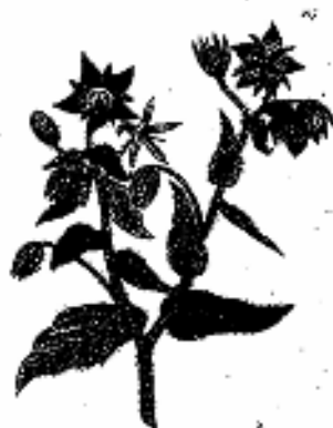
Borage ( Borago officinalis )

The use of Borage in cups [beer] is very ancient, and old writers have ascribed to the flower many virtues. In Evelyn's Acetaria it is said "to revive the hypochondriac, and cheer the hard student." In Salmon's Household Companion (1710) Borage is mentioned as one of the four cordial flowers, "It comforts the heart, cheers melancholy, and revives the fainting spirits." . . . [Borage] gives to cups a peculiarly refreshing flavour which cannot be imitated.