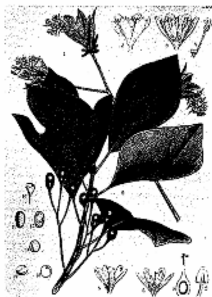
Sassafras ( Sassafras officinale )

The sassafras tree has been used for healing by American Indians for hundreds if not thousands of years, being one of the primary remedies of the