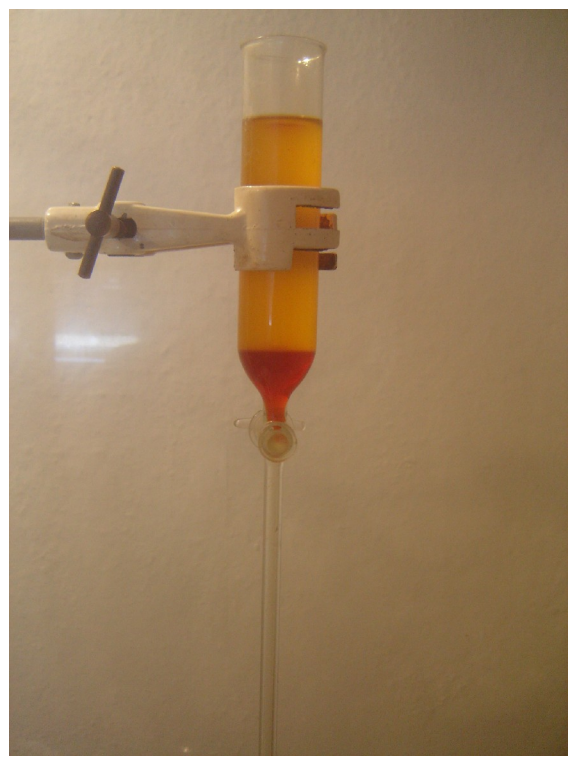
Overall view of the bromine production.