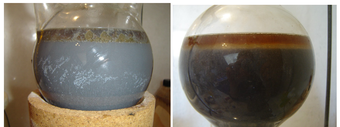
Added 100ml toluene to the mixture and put the magnetic stirrer on maximum, on the right the toluene layer in the seperatory funnel.

Now the remaining aluminium needs to be destroyed, this is done by adding 20% NaOH solution, another vigorous reaction which makes the mixture boil.