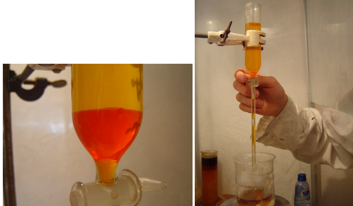
The DCM phase absorbing the bromine. The DCM layer is added to the freebase in an icebath, the freebase is first dissolved in the same volume of glacial acetic acid.