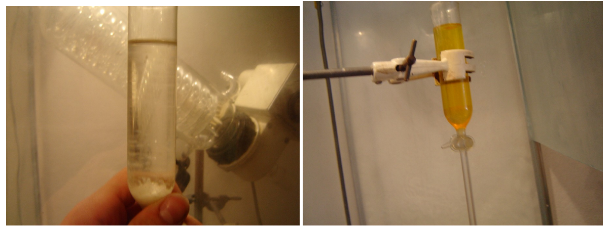
KBr and water

2,4g of KBr is dissolved in 30ml dH2O and to that 16ml 35% H2SO4 is added to that 8ml of DCM is added and then finally 0,97ml of H2O2 30% concentration is added in portions.