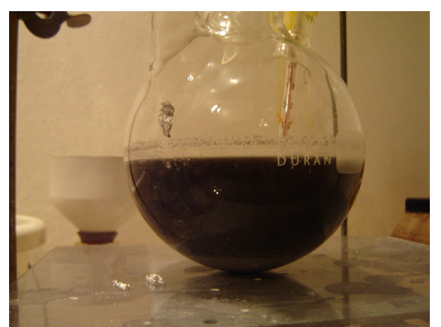
This is how it looks like after the reaction is finished