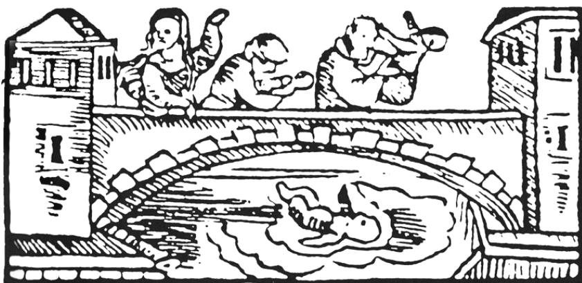
Fig. 8. Children Drowned in the Nile , woodcut from the Passover Haggadah , Prague, Gershom Cohen, 1526.