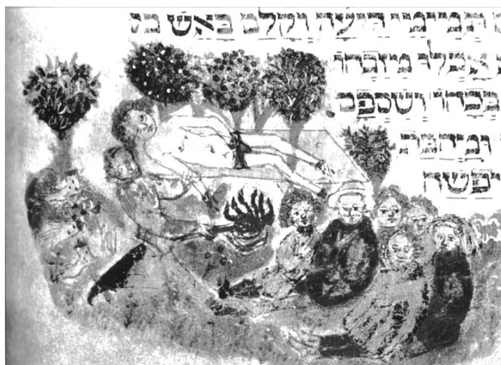
Fig. 14. German Jew Tortured with Fire , miniature from Jewish Code 37 from the Hamburg State and University Library (c. 79r).