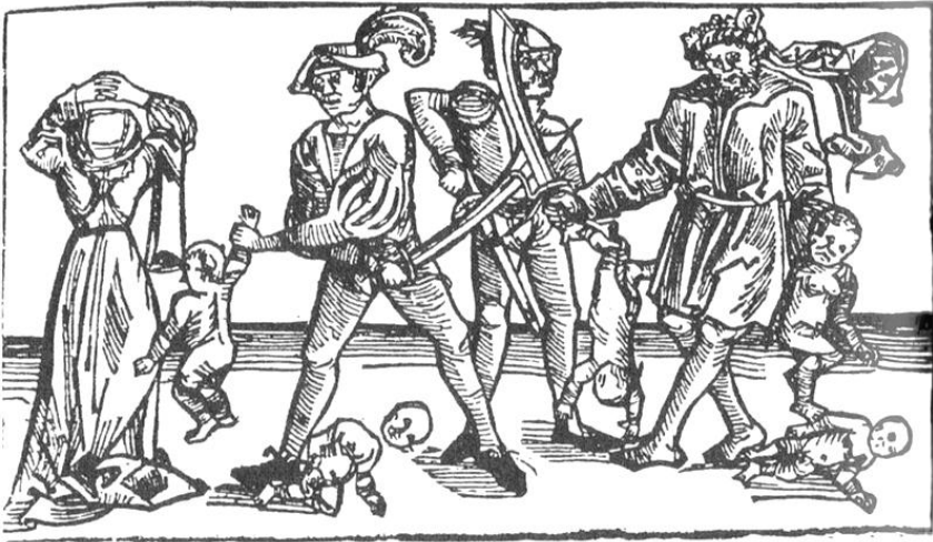
Fig. 3. The Massacre of the Innocents , woodcut from the Ultraquist Passional , Prague, Jan Camp, 1495.