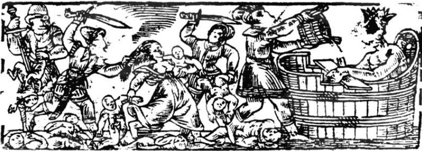
Fig. 2. The Pharaoh's Bath of Blood , woodcut from the Passover Haggadah, without publisher, circa 1580.

פרעם אין יידן קינדער בלוט ער טאט גיבארן : גאט און סולדיג בלוט ניט און גילאכן וויל לאן