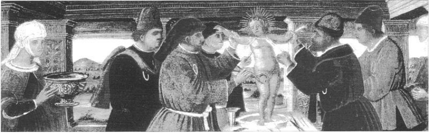
Fig. 20. Gandolfino da Roreto d'Asti, Martyrdom of Simonino , tempera on wood, end of 15th century, Jerusalem, Israel Museum.