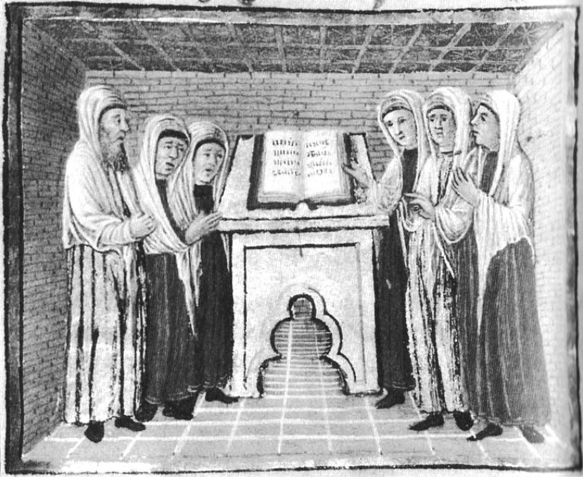
Fig. 22. Oratory of German Jews with the “almemor” , miniature from the Rothschild Miscellany , Venice (?), 1475, Jerusalem, Bezalel Museum.