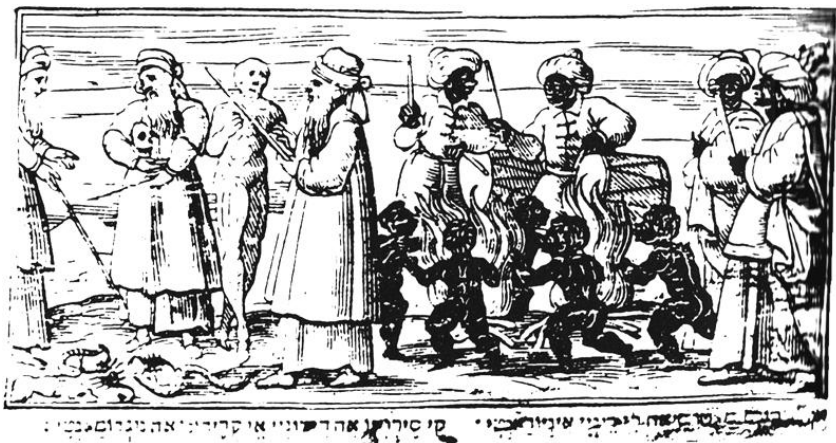
Fig. 7. Enchanters and Necromancers , woodcut from the Passover Haggadah , Venice, Giovanni De Gara, 1609.