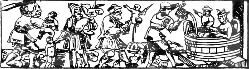
Fig. 1. The Pharaoh's Bath of Blood , woodcut from the Passover Haggadah, Prague, Gershom Cohen, 1526.

פרעם אין יידן קינדער בלוט ער טאט גיבארן : גאט און סולדיג בלוט ניט און גילאכן וויל לאן