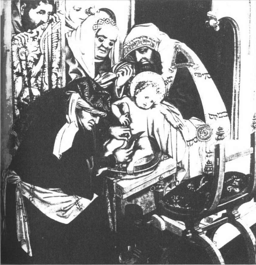
Fig. 19. Circumcision of Christ , altar piece, circa 1450, Nuremberg, Liebfrauenkirche.