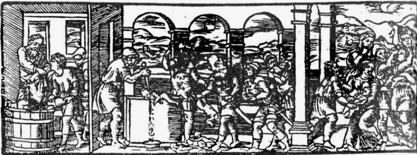
Fig. 4. The Pharaoh's Bath of Blood , woodcut from the Passover Haggadah , Mantua, Giacomo Rufinelli, 1560.