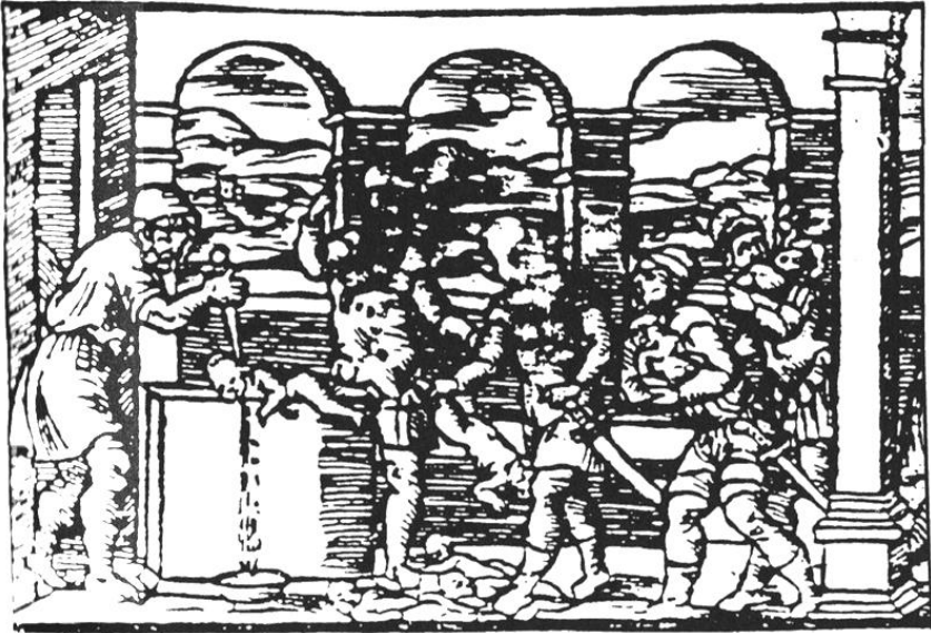
Fig. 5. The Pharaoh's Bath of Blood , woodcut from the Passover Haggadah , Mantua, Giacomo Rufinelli, 1560 (detail).