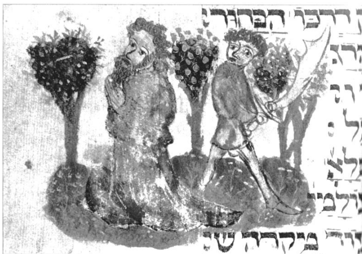
Fig. 13. German Jew Being Executed with a Sword , miniature from Jewish Code 37 from the Hamburg State and University Library (c. 79r).