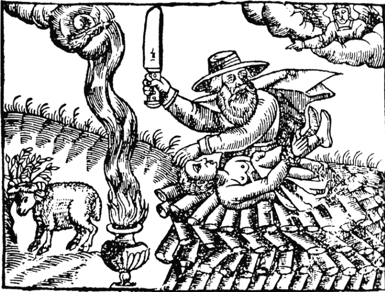
Fig. 15. Sacrifice of Isaac , woodcut from the Ritual Responsals (Sheelot w-teshuvot) of Asher b. Yechiel, Constantinople, without publisher, 1517.