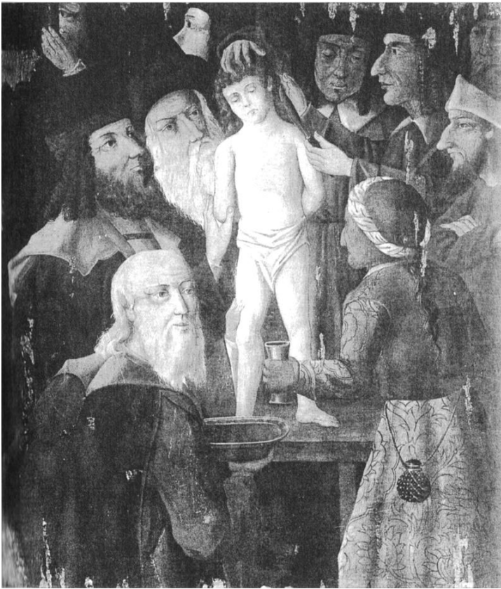
Fig. 21. Alto Adige School, Martyrdom of Simonino , first half of 16th century, Trent, Provincial Museum of Art.