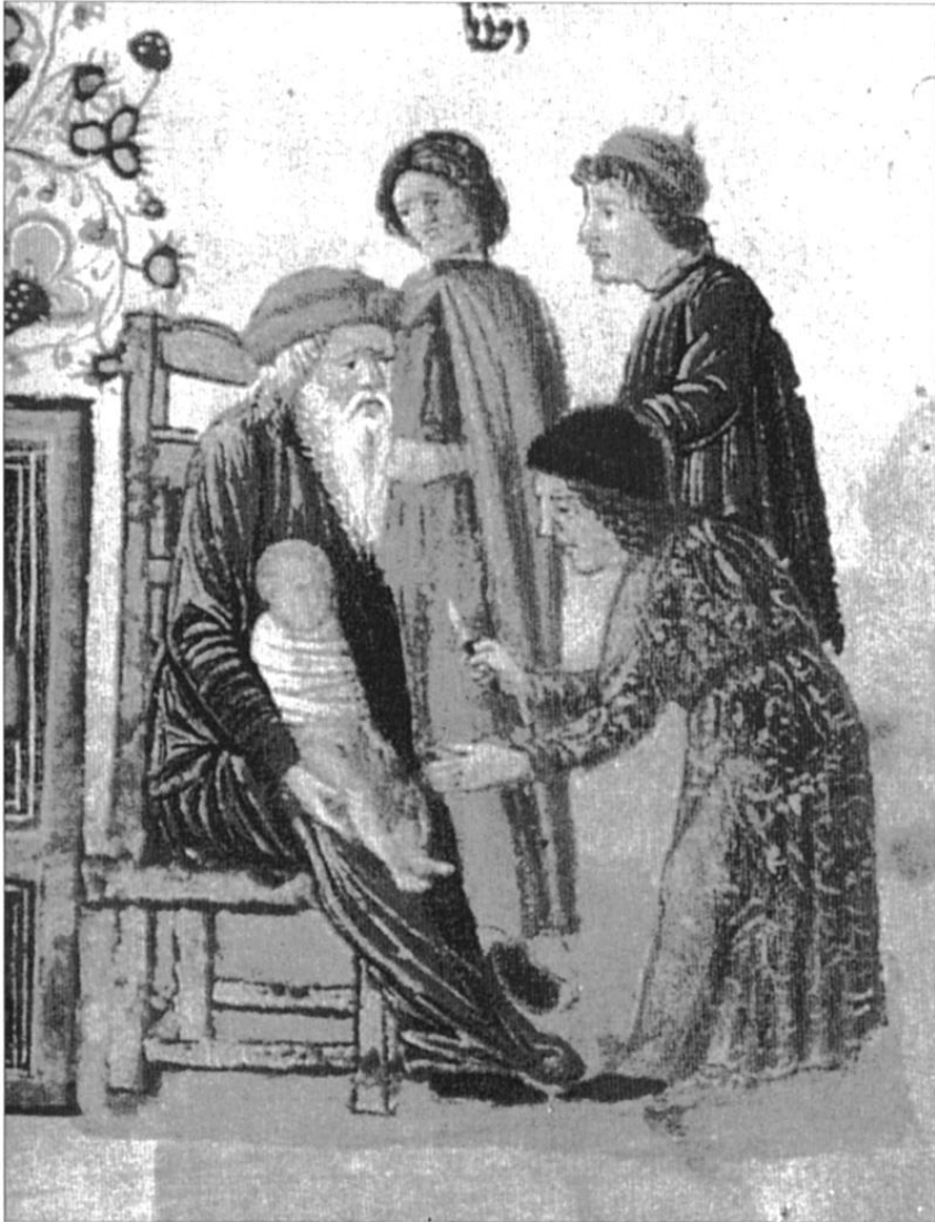
Fig. 17. Circumcision , miniature from the Rothschild Miscellany , Venice (?), 1475, Jerusalem, Bazelel Museum.