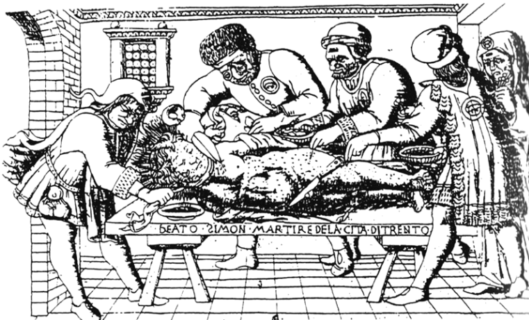
Fig. 16. Martyrdom of Simonino and Jews with Eyeglasses , woodcut, Northern Italy 1475-85 (from A.M. Hind, Early Italian Engraving , II, New York-London, 1938, table 74).