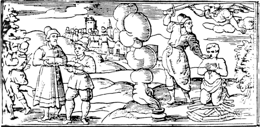
Fig. 12. Sacrifice of Isaac , woodcut from the Passover Haggadah, Venice, Giovanni De Gara, 1609.